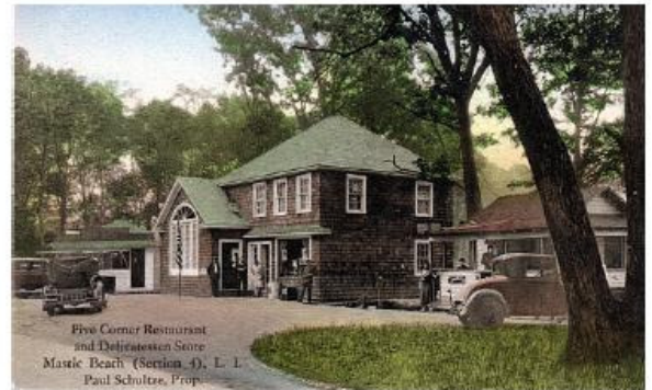
Five Corner Restaurant and Delicatessen Store Mastic Beach (Section 4), L. I. Paul Schlotze, Prop.